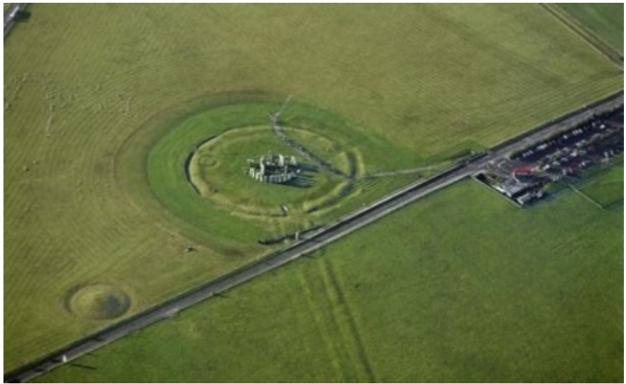
Stonehenge with its now closed (and removed) adjacent road: The A303 is top left corner