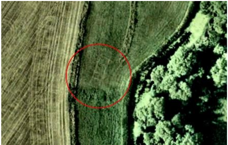
Aerial photo showing a Roman building located next to the River Stour at Wye