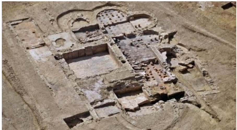
The preserved 'thermae' with central plunge pool discovered in Brittany, France

The impressive layout of the thermae was complemented on the visual scope by an assortment of paintings on the walls and ceilings of the bath, many of which are still in their well-preserved state. According to the archaeologists, previous examples of such paintings (with shell inlay coatings) have been found in Western Europe. But the Langrolay site has unveiled "an unprecedented collection" that would help experts in studying the embellished art style that was probably developed some time in 3rd century AD.